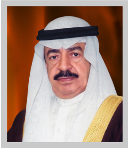
His Royal Highness