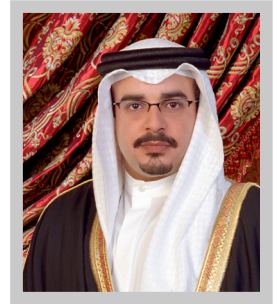
His Royal Highness